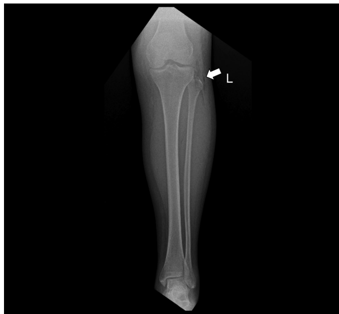
Figure 1. Left knee X-ray. Subcutaneous air densities in the superposed area over the soft tissues and fibula, adjacent to the lateral side of the knee joint

Although it is a rare complication, physicians should be reminded of the fact that patients admitted to ED with acute extremity pain and who are taking combined bevacizumab and paclitaxel therapy, carry a risk of having NF with rapid progression and death.