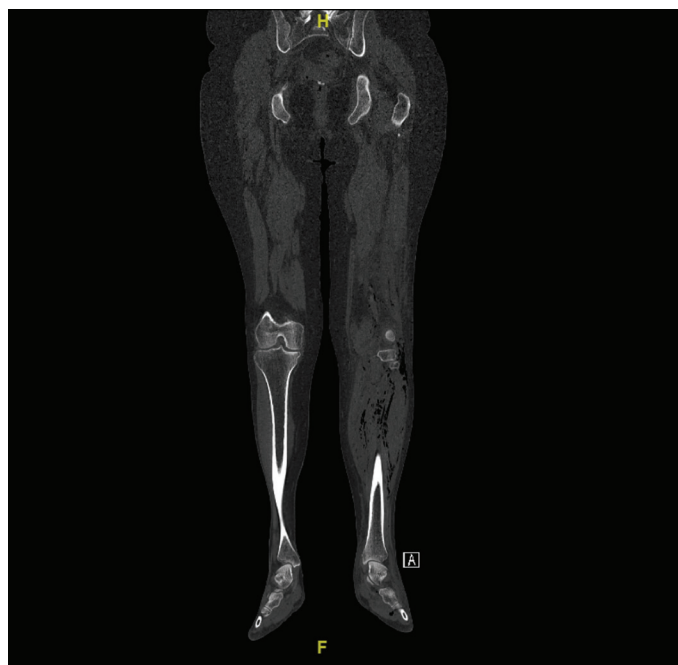
Figure 2. Lower extremity computed tomography. Air densities at the knee and cruris levels