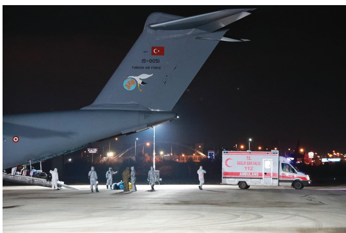
Figure 2. Transporting patients from plane to ambulance

Emergency medical services (EMS) play a vital role in responding to requests for assistance, triaging patients, and providing