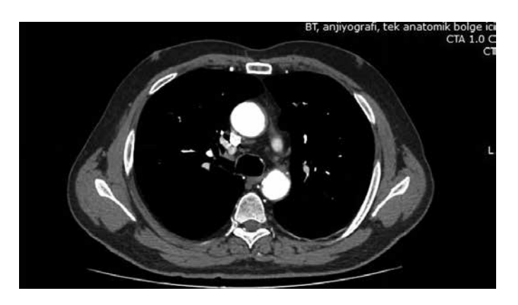
Figure 3. No findings of aortic dissection

but are usually asymptomatic. The distinction between acute and chronic SCA thrombosis is made according to clinical and radiological findings, but there are no definite criteria (2). Emergency thrombolysis or thrombectomy should be performed to prevent limb ischemia in acute form (3). In chronic form, treatment options include surgical interventions.