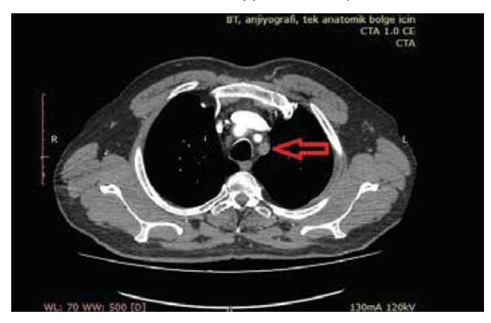
Figure 1. Occlusion of the left subclavian artery

acute form, pain in the arm, coldness, paleness and weakness of peripheral pulses may occur. Some patients in chronic form may describe claudication in the upper extremity after movement,