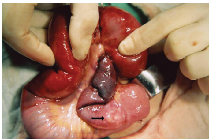
Figure 2. A solid intramural mass of size 1 × 1.5 cm at the antimesenteric border of the ileum in the upper part of the invaginated segment

it was identified by the intussusception that it caused. Though the mass was not located in the invaginated segment, we believe that the mass was the triggering factor for intussusception because we failed to observe any other pathological finding that might be considered as “leading point” in the segment. Although not observed in the present case, the site of the lesion matched with the location of Meckel’s diverticulum. Adenomyoma is thought to be originated from embryonic epithelial residues (5).