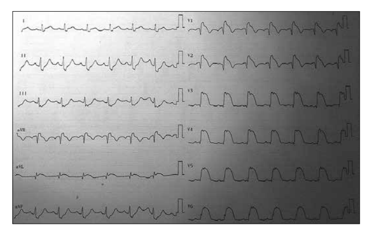
Figure 2. ECG taken after 15 min of admission ECG: electrocardiography